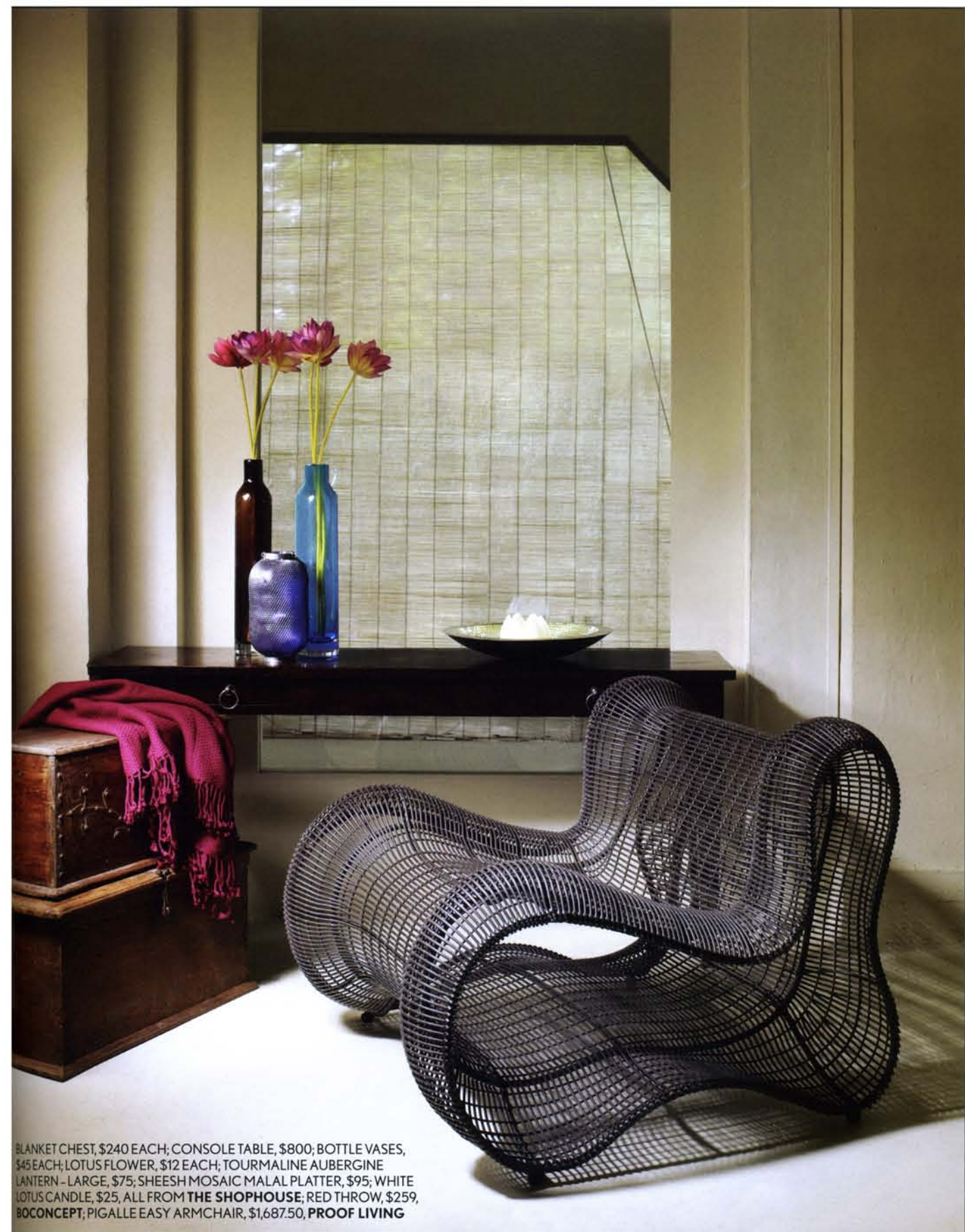
BLANKET CHEST, $240 EACH; CONSOLE TABLE, $800; BOTTLE VASES, $45 EACH; LOTUS FLOWER, $12 EACH; TOURMALINE AUBERGINE LANTERN - LARGE, $75; SHEESH MOSAIC MALAL PLATTER, $95; WHITE LOTUS CANDLE, $25, ALL FROM THE SHOPHOUSE ; RED THROW, $259, BOCONCEPT ; PIGALLE EASY ARMCHAIR, $1,687.50, PROOF LIVING