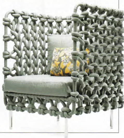
Ducati Monster Diesel; calf-leather shoes at Angelo Galasso at the Plaza; Kenneth Cobonpue Cabaret high-back armchair.

KNIT PICK * Noodles, a bouquet of flowers, and other commonplace items have inspired the furniture of Kenneth Cobonpue. His latest line takes its cue from a knitting pattern. The Kenneth Cobonpue Cabaret collection ( www.kennethcobonpue.com ) includes armchairs, lounge chairs, and sofas made of fabric-wrapped foam tubes woven around steel frames. The tubes are laced around the edges of fiberglass coffee and end tables, creating a stitched look that complements the larger pieces. Priced from $1,011 to $7,560, the items come in polyester for indoor use and in weatherproof acrylic for the outdoors. . . .